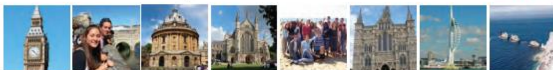
Trip destinations (left to right): London, Bath, Oxford, Winchester, Bournemouth, Salisbury, Portsmouth, Isle of Wight